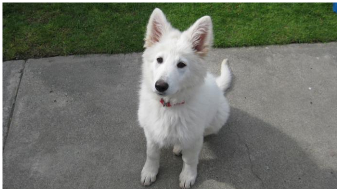
Indie aged 4 months

Indie was born on the 26 May 2012, her breed is a Swiss White Shepherd.